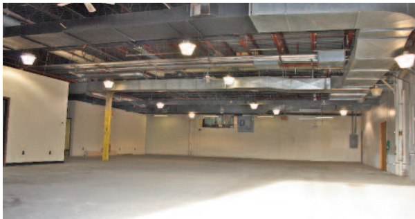
Large, open space