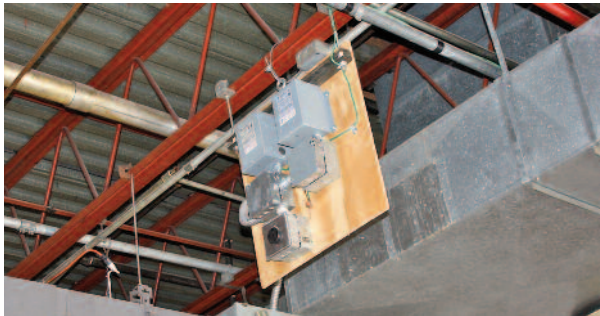
208v and 480v electric