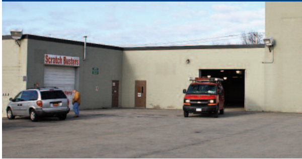
At grade overhead door, 10' x 10'