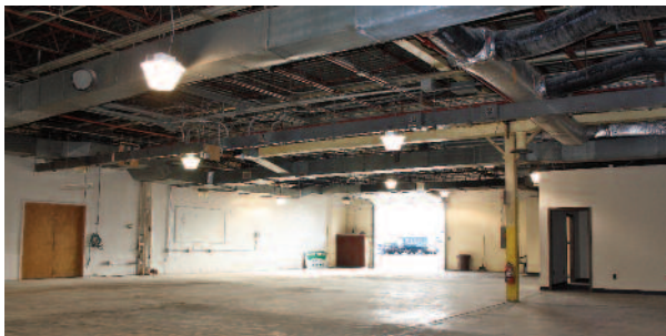
Can be built out if necessary.